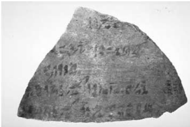
Figure 6. Ostrakon 3255 (Musée du Louvre, Paris, France)

O Lv (Ostrakon Louvre). A doe's horn, finely ground. Another fumigation similar to this: crocodile droppings, frogs' spawn; fumigate the ears (with this). A tortoise shell; fumigate the ear (with this) (Figure 6).