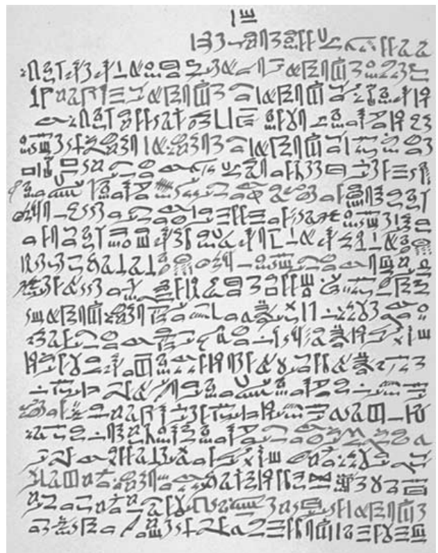
Figure 1. Ebers Papyrus, sections 764-767 (from Ebers G. Papyrus Ebers)

Eb. 767. What is done to treat effluence that is sent out from an ear: if it (the ear) exudes from its interior an effluence like ks (dirt ?), (and) if it flows over with humor like paster water, then thou shalt go round it with a hpt-knife to the limits of all that decays in it; thou shalt prepare for it: oil, honey, seed-wool, (which are) placed within it and applied to a fillet of linen and (the ear) is bandaged therewith, until it is healed (Figure 1).