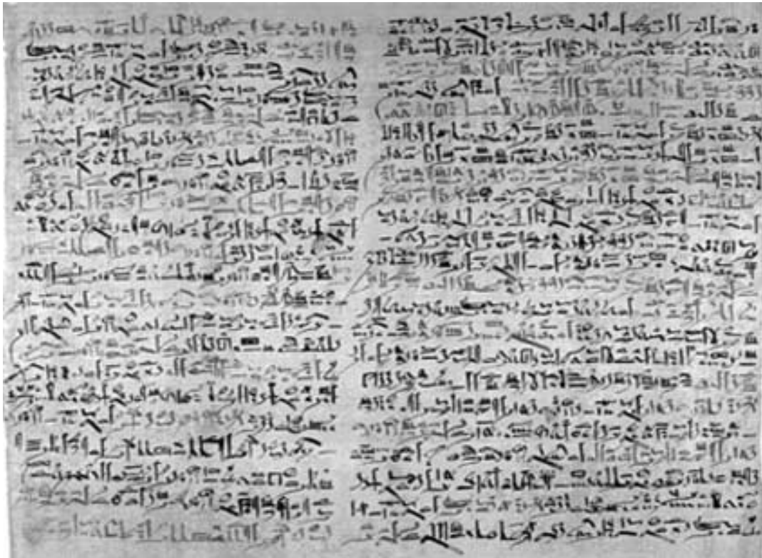
Figure 2. Edwin Smith Papyrus, cases 21-28 (New York Historical Society, New York, NY, USA)

22) have ear involvement. The use of stitches to treat a open wound is clearly explained in the description of placing the 2 lips of the wound together to ensure healing.