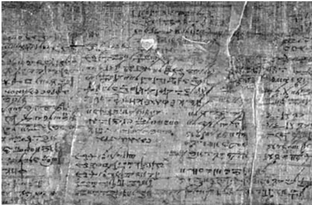
Figure 4. Leiden Papyrus, verso column IV (Leiden Museum)

Treatment of acute pain in the ear. Another (prescription) for recovering from acute (pain in the ear). ( )... ( ); to be triturated finely; to be applied to it. Another (prescription): radish, reed ( ); to put it into one; to place 1 bowl at its mouth, there being 1 (dose of)