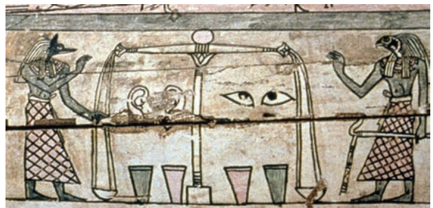
Figure-11: Wooden coffin of Teuris.

There is an enigmatic pair of ears painted on stuccoed linen and pasted on the wooden coffin of Teuris, made in first or second century AD Roman period (Figure 11). This painting shows a version of the "balance of judgment," an illustration from the 125th chapter of The Book of the Dead. [2] The scale pans are empty, and the space below the balance is occupied by one pair each of ears and eyes. These ears and eyes belong to Re (god of the sun and the supreme judge), which enable him to hear and see everything in the world. When Re performs the balance of judgment, the gods of vision and of hearing are present as his helpers in the quest for the truth. The painting can be interpreted in this way: there are 4 vessels, divided into 2 pairs, green (positive) and red (negative), sitting below the ears and eyes. The ears and eyes on top of these colored vessels recognize good and evil. Because the scales are balanced, one can conclude that Re has determined that the deceased Teuris was good during his life, had lived according to the rules of truth, and should therefore receive his reward in the afterlife [17]