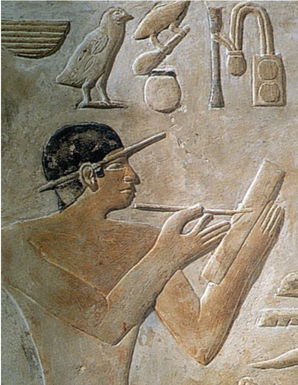
Figure-12: Half relief of the scribe Khenuka, Louvre, Paris, France.