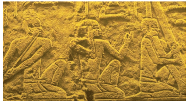
Figure-3: Gesture of hearing on a half relief, Fifth Dynasty tomb in Sacker.

shown an obvious connection between a speaker and the ear of the listener and an indication of "inner listening" that is often shown in people meditating, writing, singing, or composing. Some examples of these different "gestures of hearing" have been identified, such as one in a tomb in Saqqara dated from the Fifth Dynasty (Figure 3). Another example is a half relief representing a singer and a musician also from the Fifth Dynasty, exhibited in the Cairo Museum. The singer clicks his right fingers and holds his left hand behind his ear to listen, [5] a gesture that is still found among the singers and storytellers of Egypt. Three other examples, also from the Fifth Dynasty, are a half relief carved in limestone found in the tomb of Nehchefekta in Sacker that is displayed in the Cairo Museum and a painted limestone and a half relief in the mastaba chapel of Hetepher-akhi in Sacker.