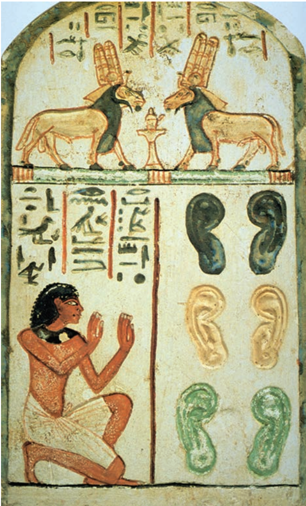
Figure-5: Ear stela of Bay, Cairo Museum.

rather than amulets (Figure 6). If they were indeed amuletic, their function would be to pray for hearing. [12] The function of amulets, however, is not always well understood, and different meanings have been proposed, for example: