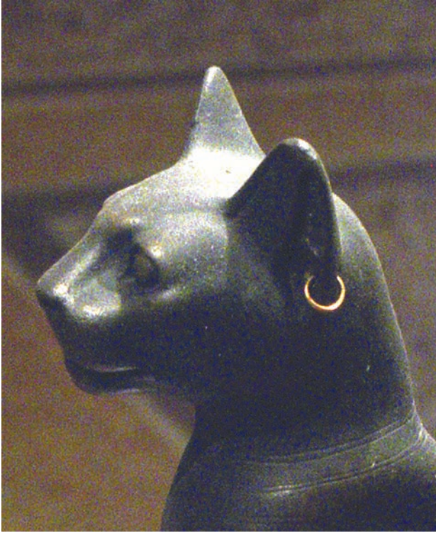
Figure-9: Cat with earring, Louvre, Paris, France.

in a statue dating back to the First Dynasty, discovered near the Nile and displayed in the Antikenmuseum in Basel, Switzerland. Another example is exhibited in the Aschmolean Museum in Oxford, England (Figure 10).