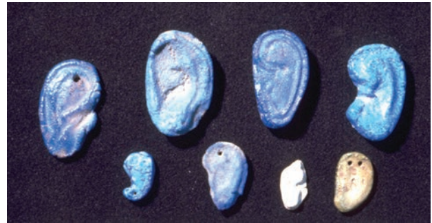
Figure-6: Ear amulets exhibited in the University of Pennsylvania Museum, Philadelphia.

These different suppositions are debated even today. Ear amulets are not exactly a mediator in prayer, but they can be, which is the reason why they are presented here. Amulets can also be found in many museums with displays of Egyptian artifacts.†