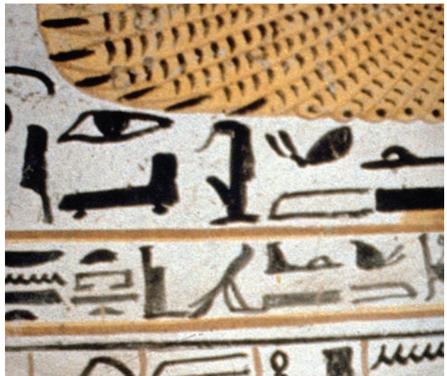
Figure-1: An example of a cow's ear in a 20th Dynasty hieroglyph, found in a tomb in Deir el-Medineh.

hieroglyph for ear is a cow's ear. In the beginning this sign was just an ideogram for an animal's ear and later was generally taken to apply to both the ear and hearing. This hieroglyph is built up by the cow's auricle and two small lines that attach the ear to the body (Figure 1). The first combination of a cow's ear with a human face was probably Hathor, the goddess associated with joy, fertility, music, and dancing. Hathor's cow ear can be observed in Egyptian art through many dynasties at different cult sites in many important ancient Egyptian cities. The first representation is found on Narmer's palet exhibited in the Cairo Museum, dating from the First Dynasty, but this motif was used mainly on temple columns as seen in the Hatshepsut temple of the 18th Dynasty in Deir el-Bahri (Figure 2). The hieroglyphic sign for ear is also found on half reliefs and tomb paintings, such as the Sennedjem tomb of the 19th Dynasty in Deir el-Medineh. [3] It is important to note that the accurate depiction of ear anatomy can be found as far back as the Fourth Dynasty.