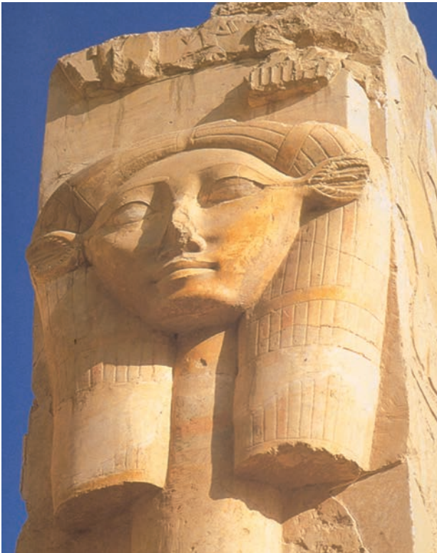
Figure-2: Hathor column in temple of Hatshepsut, Deir el-Bahri.

Egyptian life. It was thought that "the breath of life entered the left ear and the breath of death entered the right ear" [4] . The hieroglyphic sign for the ear, and later also for hearing, was a cow's ear, sometimes presented alone but more often depicted on the human head, particularly of the goddess Hathor. Three main ear functions are recognized in the visual art of ancient Egypt: hearing, mediation while in prayer, and decoration, but there also exist the possibility of deformation. These different functions will be detailed here.