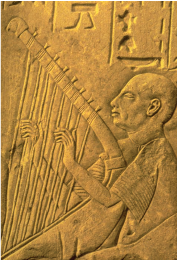
Figure-4: Blind harpist, Leiden Museum, The Netherlands.