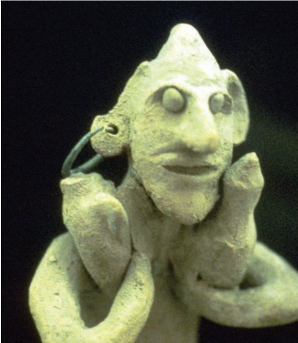
Figure-7: Head of a statue with earrings, Rikjsmuseum, Amsterdam, The Netherlands.

exist, and the most representative ones are Nefertiti, Tutankhamun and Ramesses II. Nefertiti was the wife of Akhenaten, a pharaoh of the 18th Dynasty. Her most well-known bust, with evident pierced earlobes, is displayed in the Egyptian Museum of Berlin, Germany (Figure 8). The richest treasure of ancient Egypt was found in the tomb of Tutankhamun, another 18th Dynasty pharaoh, including statues, sarcophagi (especially the one with the famous gold mask, now exhibited in the Cairo Museum), paintings, all depicting the pharaoh with well-designed, pierced earlobes. Pierced earlobes were also apparent on Tut's mummified head. Finally, Ramesses II, a pharaoh of the 19th Dynasty, considered one of the greatest pharaohs of ancient Egypt with a reign of 67 years, also had pierced ears, seen on his statues in the Abu Simbel rock-cut temple.